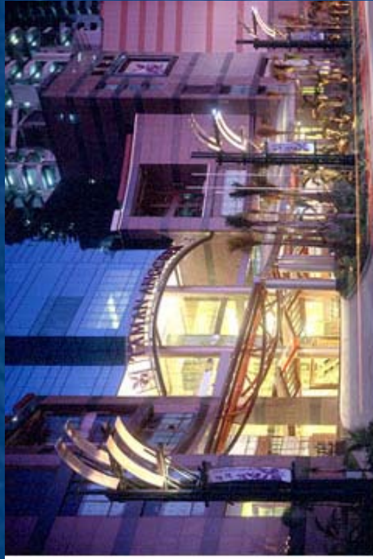
Taman Angrek Mall & Condominium JAKARTA - INDONESIA