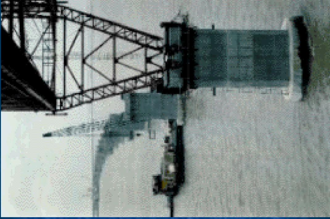
Jamuna Multipurpose Bridge