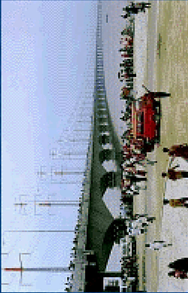
Jamuna Multipurpose Bridge