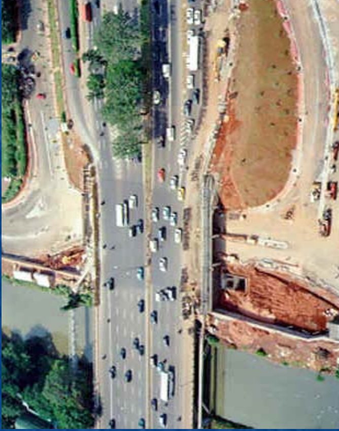
Most freeway flyovers in Jakarta