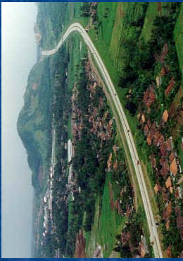
Jakarta - Merak Toll Road (about 50 km section)